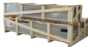
The silos are shipped in wooden crates. This 50 m 3 silo is ready for collection.