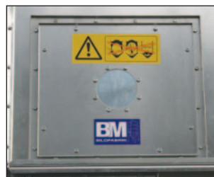
Inspection door with window.